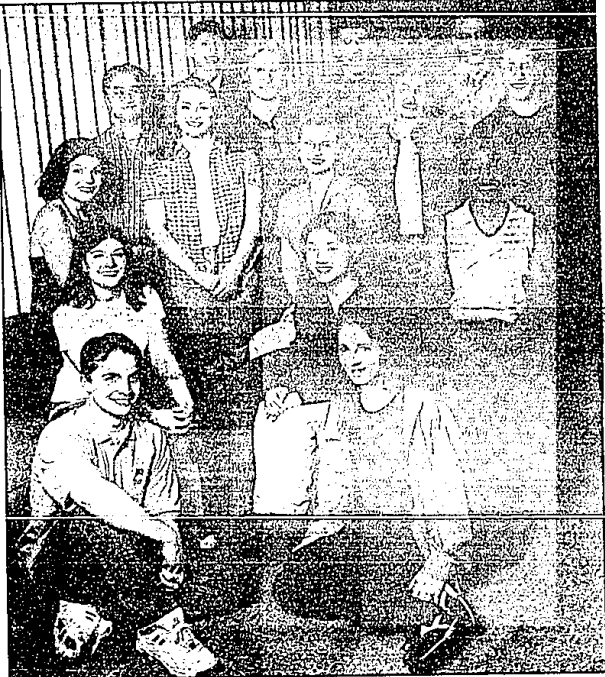
Top scholars: Meet some of the most accomplished high school seniors in the metro area, the 1998 Observer Academic All-Star Team. Also, see related story on page A6.