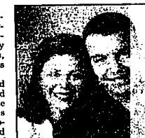
planned at St. Fabian Catholic Church in Farmington Hills.