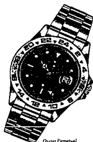
Oyster Perpetual Explorer II