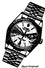
Oyster Perpetual Datejust

GREENSTONE'S CREATORS OF FINE JEWELRY SINCE 1923