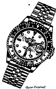
Oyster Perpetual GMT-Master II