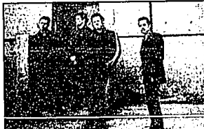
Homecoming: Metallica bassist Jason Newsted (second from left) returns home to Michigan to play two shows at Pine Knob Music Theatre Friday-Saturday, July 10-11, with the rest of his band - from left, drummer Lars Ulrich, guitarist/vocalist James Hetfield and guitarist Kirk Hammett.

Cantrell and Days of the New, will be a reunion for Newsted; he was born in Battle Creek and raised in Niles and Kalamazoo. Newsted moved from Michigan 17 years ago at age 18. He resided in Phoenix, Ariz., in 1981-1986 during which time he played in the rock band Kustom ans. When Metallica's original bassist Cliff Burton died, Newsted took his place. Newsted still has family in the state and returns twice a year. "It's usually at Christmas and I was there two weeks ago (in early May). I've got some ATVs (all-terrain vehicles) back there. I get crazy and become a kid again. I get the motorcycles out and do a