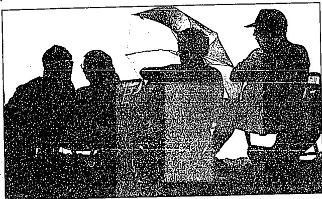
Fans: Concert-goers set up their chairs on the crest of the hill for a good view and nice sounds.