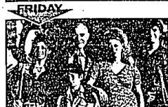
Marisa Tomei (left to right), Alan Arkin (front), Eli Marienthal, Natasha Lyonne and David Krumholtz star in "Slums of Beverly Hills," opening today at metro Detroit movie theaters.