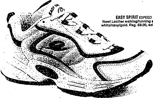
EASY SPIRIT ESPEED New! Leather walking/running shoes in white/navy/gold. Reg. 69.00, sale 59.99.