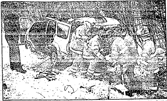
Rollover: Farmington Hills firefighters extricated a family of four from their car that overturned one eastbound I-696, east of Orchard Lake Saturday morning. The Northville residents received minor injuries and were transported to Providence Hospital in Southfield.