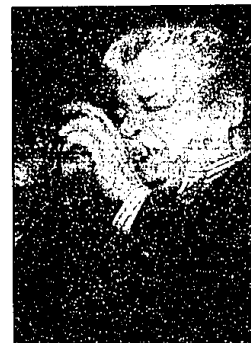
Please see MUSIC, E2

"When I was in Montreal, my mother was just slightly disappointed that I wasn't going to be a classical violinist."