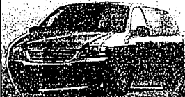
NEW 1999 WINDSTAR LX