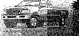
NEW 1999 F150 SUPERCAB XLT