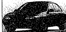
NEW 1999 ESCORT SE