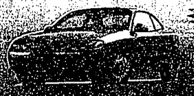
NEW 1999 ESCORT ZX2 COUPE