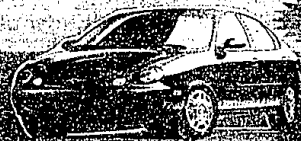
NEW 1999 TAURUS SE 4 DR SEDAN