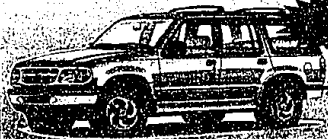
NEW 1999 EXPLORER XLT 4x4