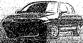
NEW 1999 CONTOUR SE