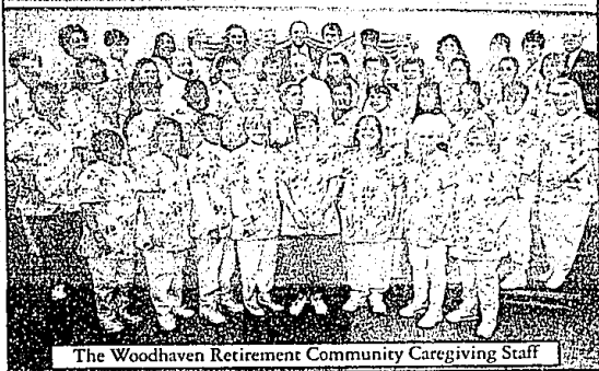
The Woodhaven Retirement Community Caregiving Staff