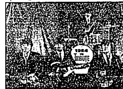
"1964... The Tribute," a Beatles tribute band, returns to the Magic Bag, 22920 Woodward Ave., Ferndale at 8 p.m. Tickets are $15 in advance. For more information, call (248) 544-3030 or visit http://www.themagicbag.com