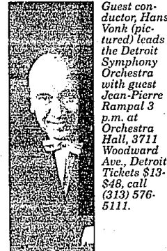
Guest conductor, Hans Vonk (pictured) leads the Detroit Symphony Orchestra with guest Jean-Pierre Rampal 3 p.m. at Orchestra Hall, 3711 Woodward Ave., Detroit. Tickets $13-$48, call (313) 576-5111.