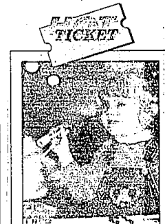
Kids can roll up their sleeves, create a hand puppet, and enjoy a variety of family-oriented activities at Henry Ford Museum in Dearborn during Family Fun Month, weekends through Sunday, March 28. The museum is open 9 a.m. to 5 p.m., call (313) 271-1620 for more information.