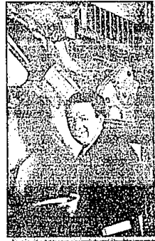
Tribute to industry: Diego Rivera in early 1932 as he worked on the "Detroit Industry" frescoes at the Detroit Institute of Arts. The mural is considered the finest example of the Rivera's work.