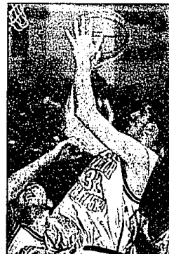
Top scorer: Emir Medunjanin scored 38 to lead the Raiders.

The Raiders made 18 of 31 free throws, zero of nine threes. The Falcons were 13-of-19 at the line and 2-of-13 behind the arc.