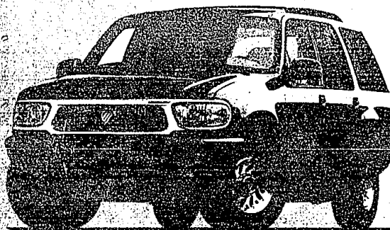
1999 MERCURY MOUNTAINEER

FEATURES INCLUDE: 4.0L OHV V-8 engine • All-wheel drive • Power windows and door locks • Second Generation dual air bags* • 4-wheel disc anti-lock brakes • Fingerprint speed control with tap-up/tap-down feature