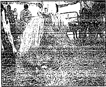
Whoa a minute: A miniature horse takes a break during the petting zoo in downtown Farmington Aug. 4.