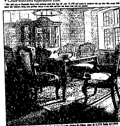
River Runns dining room, table, 4 side chairs, 2 arm chairs & china, mar. $11,770 Sale $7,999