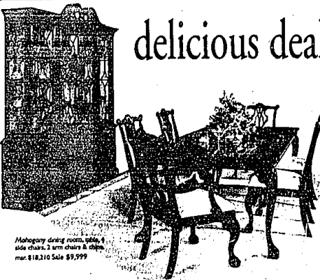
Mahogany dining room, table, 4 side chairs, 2 arm chairs & china, mar. $18,210 Sale $9,999

prior sales excluded. With deposit and approved credit.