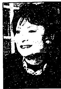
'You hold onto life in a far more precious way.'