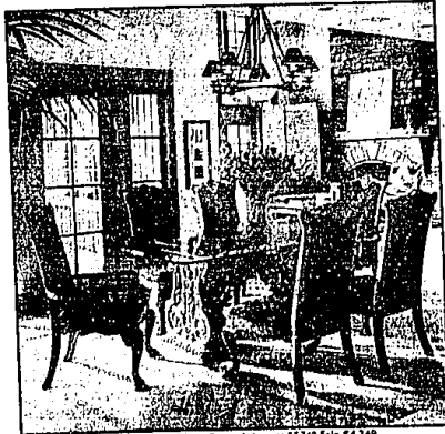
Saratoga dining room, table, 4 side chairs, 2 arm chairs, mar. $7,740 Sale $4,349

For exclusively Thomasville McLaughlin's Thomasville HOME FURNISHINGS OF NOVI 248.344.2551 47200 Grand River, Novi