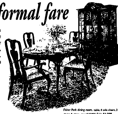
Fisher Park dining room, table, 4 side chairs, 2 arm chairs & china, mar. $10,905 Sale $6,089