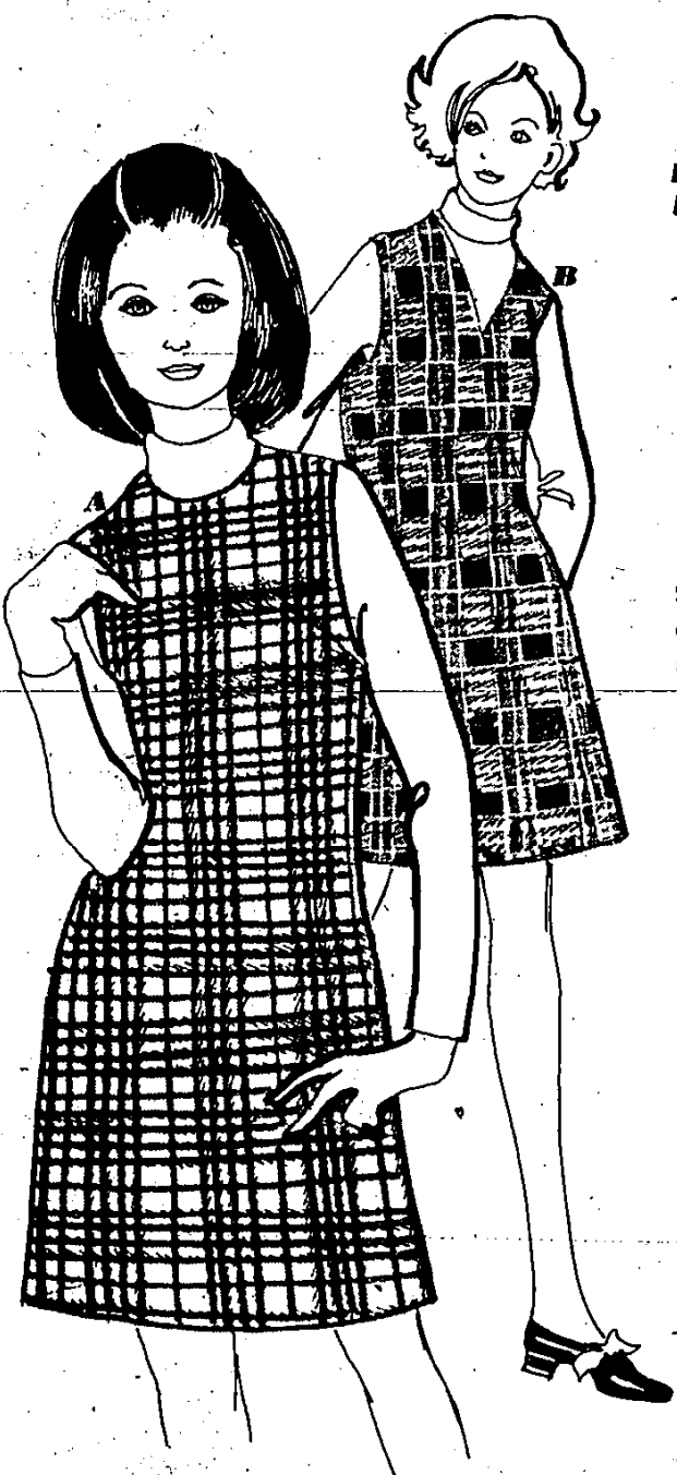
plaid jumpers with long back zippers

Super-snazzy looks to wear on through winter... misses' sizes in favorite fabrics. Savings-priced, too