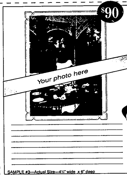
SAMPLE #3—Actual Size—4 1/2" wide x 6" deep

Send sample ad you want attached to the message form, along with your photograph and your payment.