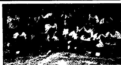
The Hammerheads hail the new millennium and remember March 16, 1999.