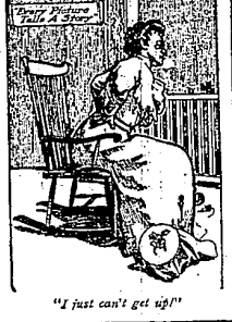
"I just can't get up."

When Kidney Troubles Keep You in Misery Day and Night