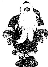
Collectible Santas $35 or 3/$90.

The school board gave the go-ahead to seek bids for the expected $150,000 project which will add space for 42 more buses beyond the district fleet of 131.