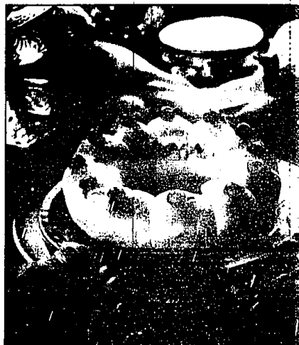
Sweet jewel: Celebrate the Twelfth Night of Christmas on Thursday, Jan. 6, by serving King Cake.

King Cake is traditionally served on Jan. 6 and enjoyed throughout the Epiphany season, which ends with Lent or Ash Wednesday. Variations of this treat are popular during Mardi Gras celebrations all over the world. See recipe inside.