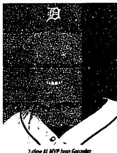
2-Time AL MVP Juan Gonzalez