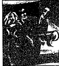
This season: Here's the program cover for the current theater season at the Grand Theatre.