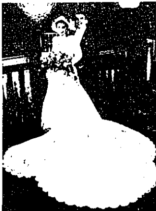
King's Court Castle Restaurant showcases unique varieties from France, European antiques, tapestries, unique collectibles from around the world and the chandeliers from the Michigan Theatre, since 1924

King's Court Castle Restaurant is located at historic Olde World Canterbury Village in Lake Orion, Michigan.