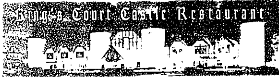
King's Court Castle Restaurant • 2425 Lakeside Court, Lake Orion, MI 48064