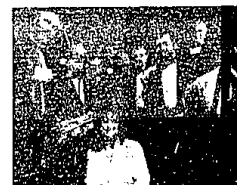
Evening escapes: The Couriers will play swing music for dancing at a benefit for the Plymouth Community Arts Council.