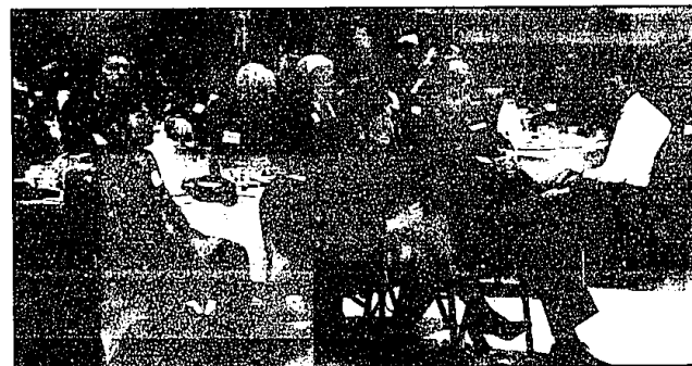
Audience: A record crowd turned out for the 2000 State of the Cities breakfast Thursday at Farmington Hills Manor.

"I think there's a camaraderie," he said. "There's a common goal both cities share."