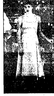
Sweet styles: Bare midriffs, shoulders and backs, feminine details and separates sweep prom looks, $132-156 all at Jacobson's.