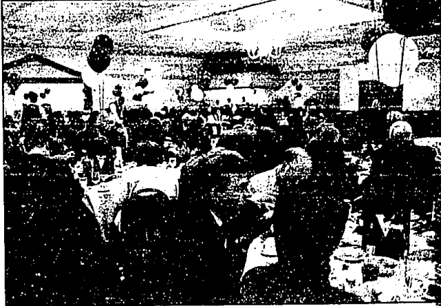
Good show: Guests at Steppingstone's seventh annual benefit auction enjoy the program at St. Mary's Cultural Center in Livonia. More than $25,000 was raised for the school.