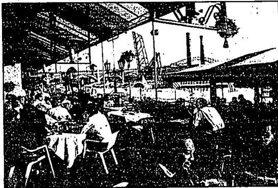
CVB OF GREATER CLEVELAND

It's true. West Side Market's reputation for fresh meats, fish,