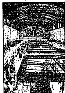
CVB OF GREATER CLEVELAND

Dining: Have a seat at one of the restaurants on the banks of the Cuyahoga River.