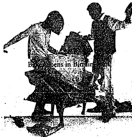
By Tom Petros in Birmingham

The video has been playing on Cable TV Channel 8 and will be played more often as the planting season progresses.