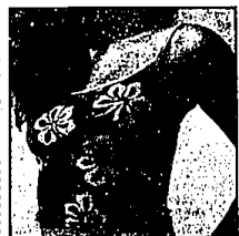
Built-up tank: Sexy and undeniably fun, it's available at Target, Frankie and Debbie's and J. Crew.