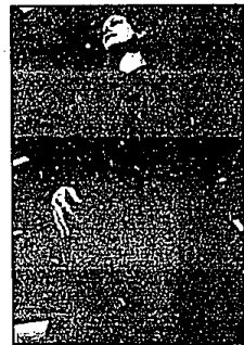
Quilted look: Zip sweater and opaque hose sport geometric patterns in plum over a grey skirt. (left) Chanel's fall collection shows quilted accents on shirts, jackets and sweaters. The top (right) carries the motif in a pairing with grey slacks.

Silver, white and gray color the new ski gear line. Detachable jacket sleeves allow skiers to go from mountain to lodge without changing clothes