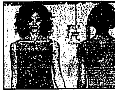
Sparkle: Paillettes add gold shimmer to a black dress.