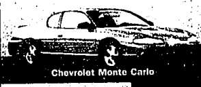
Chevrolet Monte Carlo