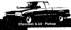
Chevrolet S-10 Pickup

Each weekday at 6:00 p.m., we're giving away a new Chevrolet and also $500 cash prizes.