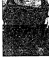
Save on all men's swimwear