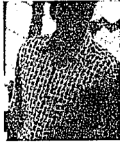
Save on all J. Ferrar® menswear Sale 17.99 Reg. $24. J. Ferrar® patterned rayon shirt.