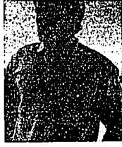
Save on St. John's Bay® menswear Sale 11.99 Reg. 14.99. St. John's Bay® cotton pique polo shirt.