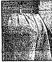
Save on Dockers® menswear