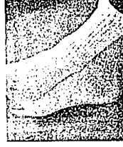
Save on Gold Toe® & Jockey® athletic socks