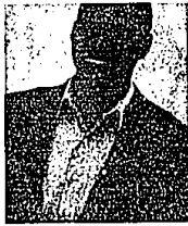
20-50% off all sportswear, suits & dress slacks Sale 69.99 Reg. $175. Scazzini® single-breasted sportcoat.