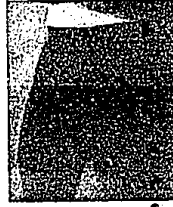
Save on all Stafford® and Towncraft® underwear