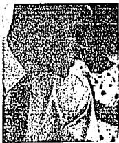
Save on all dress shirts and ties Sale 24.99 Reg. 29.50. Scazzini® Executive wrinkle-free dress shirt.