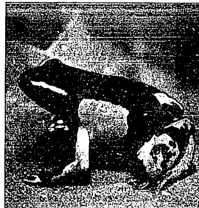
DETROIT ZOOLOGICAL INSTITUTE