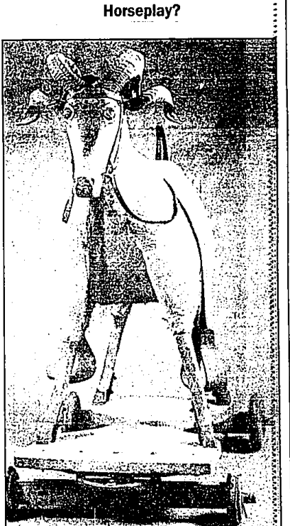
19th century art: Fantasy and Function , an exhibition of American folk art from 1840-1965, is being shown at the Hill Gallery in Birmingham through July 29. Call (248) 540-9288 for more information.