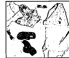
Popular styles: Look for suits by Girlstar (upper left), and La Blanca, right, Beach Club sandals and sunglasses by Blue Gem.

The company also runs stores in Ohio and Minnesota.