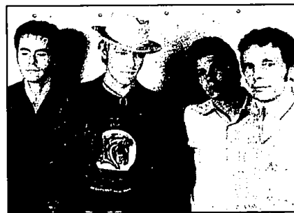
Kick it into gear: 16 Horsepower will stop in Detroit, Saturday, Feb. 17, while on tour to support "Secret South."