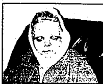
Day one, just hours after surgery

Photographs help illustrate the healing process