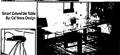
Smart Extendible Table By: Cal Nova Design