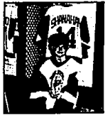
Have your photo taken in front of your favorite Red Wings locker!