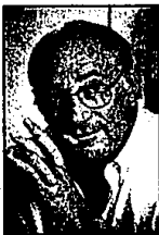
Monte Nagler World Renowned Photographer

Monte's Photographic Experience & Travels