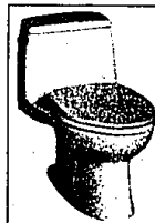
TOTO® 1.6 GPF

If your toilet will not flush or you have to flush it two or three times to clear the bowl, you are a victim of the new 1.6 gallon per flush toilets. There is a solution. A company called Toto, the world's largest manufacturer of plumbing products, has a full line of high performance 1.6 gallon toilets. These toilets feature: • Most powerful gravity flush toilet ever • 2 1/8", 100% glazed trapways, largest in the industry. • 3" flush valve vs. standard 2" • Consumer Digest Best Buy. • Siphon jet action to assist performance for efficiency. • Designed for commercial and residential installations. The toilet you select should be able to perform flawlessly. You should have a sense of confidence in your toilet, knowing it will function with one flush.