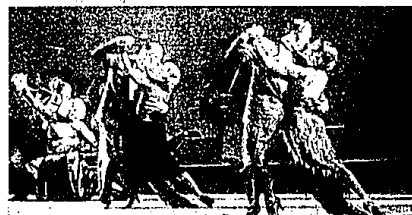
At the Opera House: The tango was born in the brothels of Buenos Aires and became a socially acceptable as ballroom dance at the turn of the century.

■ Argentine Tango Club of Detroit (of Dearborn Heights), (313) 251-3236: group classes, 8 p.m. Monday at La Casanova, 5658 West Fort St. in Detroit; 8 p.m. Tuesday at DanceSport Academy of Michigan, 23666 Park in Dearborn; 7 p.m. Thursday at Pittsfield Grange, 3338 Ann Arbor-Saline Road in Ann Arbor; and 8 p.m. Friday at Farmington YMCA, Farmington Road, just north of 12 Mile Road.