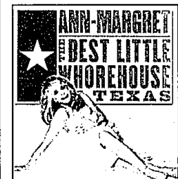
The Stage: Ann-Margret in a publicity photo for The Best Little Whorehouse in Texas , now playing at The Fisher.