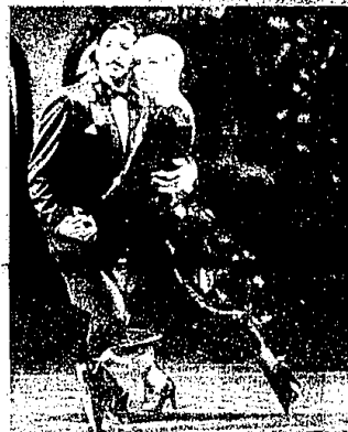
Passionate Dances: Two become one as Argentine Tango dancers move in sync.

■ Thursday, Friday and Saturday performances are preceded by an exhibition of dance by Argentine Tango Detroit students and followed by a milonga (tango dance party). Milonga tickets are $15 per person.