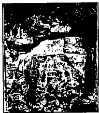
Natural: Inglis Falls.

In keeping with the tradition of the driving vacation, my husband, two kids and I explored a section of Ontario, Canada, where rural ruled. Armed with nothing but a AAA Trip Tik and a vague idea of our destination, we crossed the Blue Water Bridge in Port Huron to Canada and headed north on Provincial Route 21 along the eastern coast of Lake Huron.