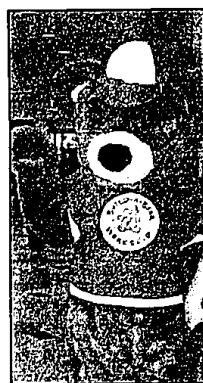
Bear Hugs: Build-A-Bear Workshop bear gave hugs.

DuRei says a committee is looking into four or five possible projects being considered with this year's proceeds. Figures were not yet available from a mall spokeswoman.