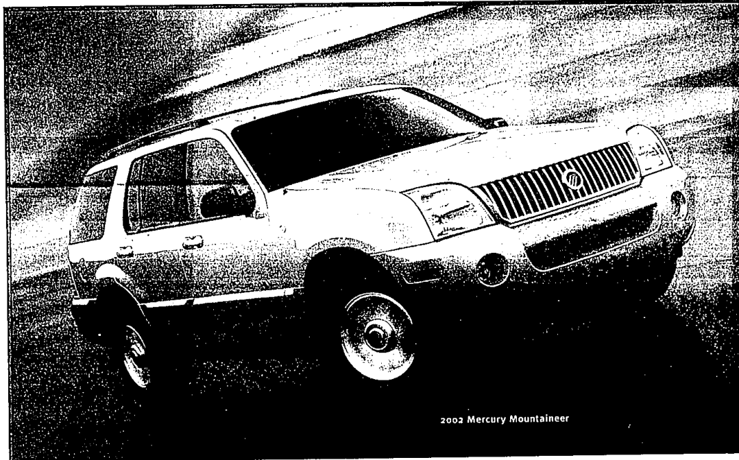
2002 Mercury Mountaineer

We Accept Visa & Mastercard Your Purchase Helps Us, Helps Others!