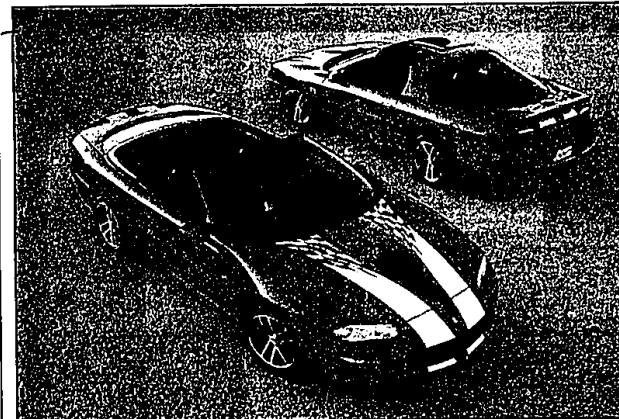
Happy anniversary: Chevrolet celebrates the Camaro's 35th anniversary by introducing a limited edition 35th Anniversary Package in 2002, available on SS Coupes and SS Convertibles.

Prizm continues as a well-equipped compact sedan as it begins its final model year. Standard Prizm features include a 1.8-liter I4 SFI engine, air conditioning and rear-floor heater ducts.