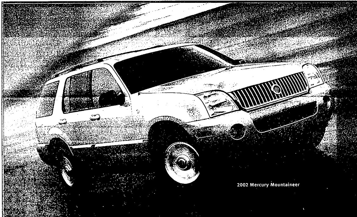
2002 Mercury Mountaineer

■ Group discussion, Feb. 12, Feb. 26, March 12, 26; April 9, April 23. ■ New group for those divorced over 1 year. Meets from 7:30-9 p.m. across the hall from WRC, Feb. 14, March 14, and April 11.