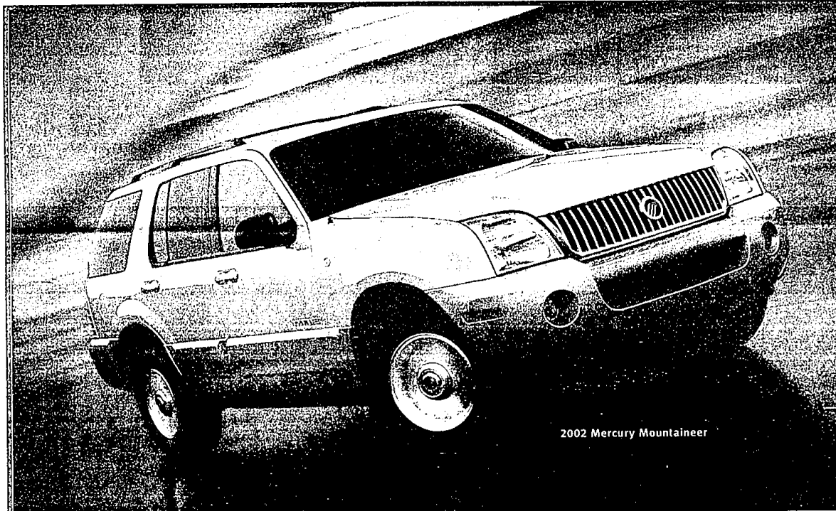
2002 Mercury Mountaineer

Menu includes roast pork with stuffing, pasta, lamb, mushroom ravioli, mussels, and ribs, along with carved ham and prime rib, shrimp and crab, smoked fish, assorted salads and desserts.