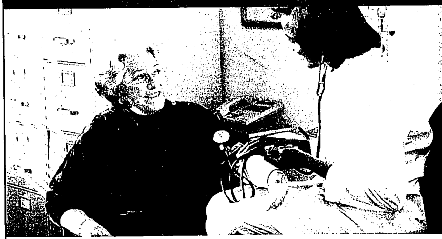
She's someone's grandmother.

She's seen a lot in her time. That's why, at Botsford, we see her as much more than a patient. We see her as a loving and dearly loved parent and grandparent. So along with prevention, diagnosis, treatment and rehabilitation, we provide another vital ingredient - the nurturing and encouragement needed by a person facing the challenges that come with advancing years. Whether it's an exercise class, physical therapy or joint replacement that's needed, our full continuum of care is available at all times for treatment and support. We know that she'd much rather be home with a child in her lap, than be in the hospital with a doctor at her side. Botsford Care does everything possible to make that possible.